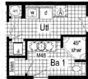
Opt. Corner Shower

(omits island & linen) (N/A w/opt glamour bath)