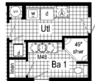
Opt. Corner Shower

(omits island & linen) (N/A w/opt glamour bath)