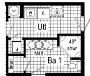
Opt. Corner Shower