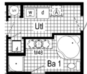
Optional Glamour Bath