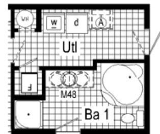
Optional Glamour Bath (N/A w/opt stairwell) (omits linen)