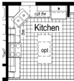
Opt. Hearth Kitchen (Only w/ Flat Ceiling)

PRICE INCLUDES: Furnace and Water Heater installed on Main Level Delivery Installed on Your Foundation Blueprints Post jacks Tax